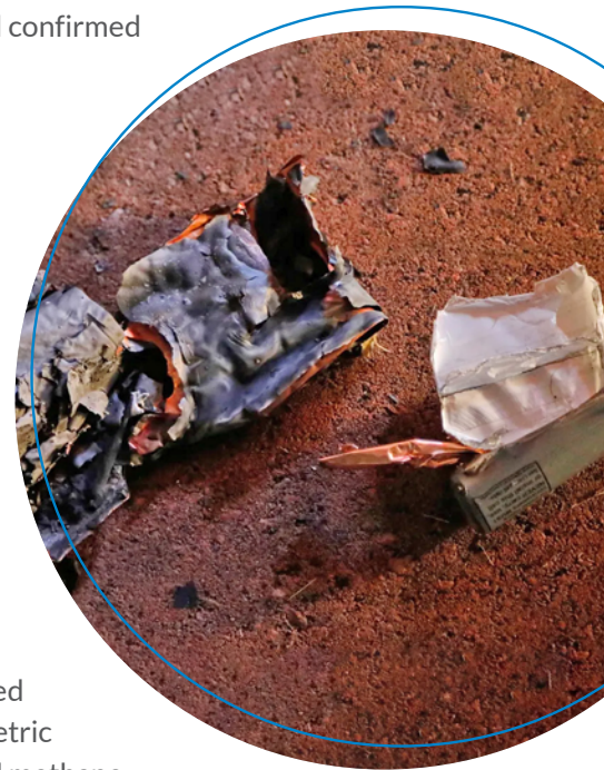
The remnants of an exploded li-ion battery.

Reachback personnel confirmed the results and even identified some very minute components through detailed spectral data review. These additional materials included acetylene, formaldehyde, ethene, and even some unidentifiable substances. The ThreatID gas-phase results were confirmed on-site using colorimetric tubes which detected methane, ammonia, and formaldehyde