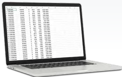
MAVEN data output from device