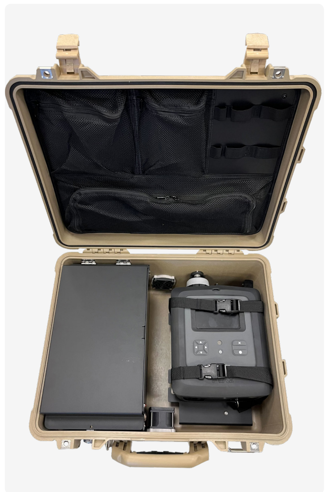
The MX908 Beacon is a remote area monitoring solution that provides real-time identification of aerosol and vapor chemical warfare agents (CWAs) and pharmaceutical based agents (PBAs) for extended durations.