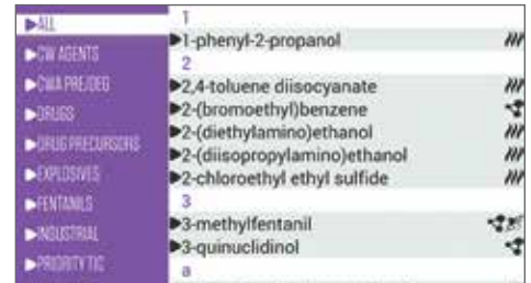
The enhanced selectivity of MX908 allows for even broader threat category coverage.