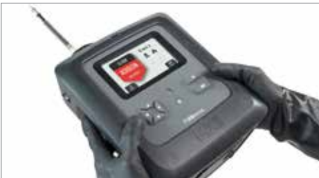
MX908 is rugged and meets the requirements for use in harsh environments.