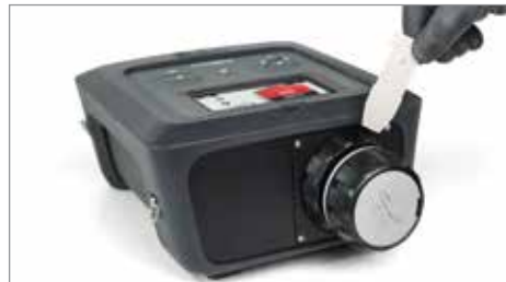
MX908 is equipped with modular accessories for ease of transition between solid and vapor sample types.