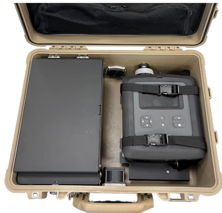
MX908 Beacon accessory for remote area monitoring