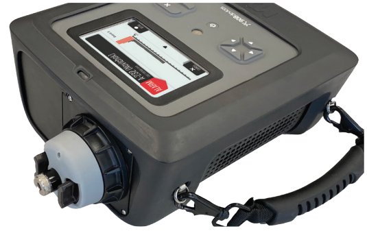
MX908 is rugged and meets the requirements for use in harsh environments.