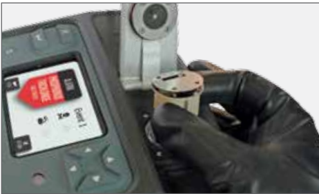
Patented microscale ion trap technology enables operation without the need for extreme vacuum or additional gas supply.