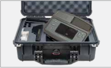
Rugged and resistant to salt spray and other harsh environmental conditions.