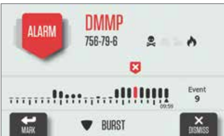
M908 allows for continuous monitoring of potential hazards.

M908 is subject to export controls including those of the Export Administration Regulations of the U.S. Department of Commerce, which may restrict or require licenses for the export of product from the United States and their re-export to and from other countries. Patented technology www.908devices.com/patents © 2017 908 Devices